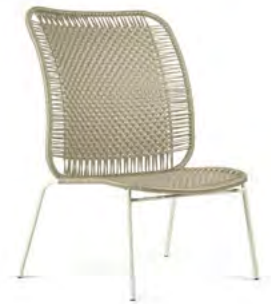
winter grey/pearl white 00ACLC2-9