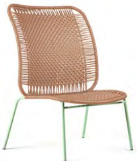
caramel brown/pastel green 00ACLC2-7