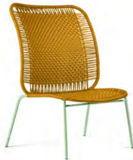
honey yellow/pastel green 00ACLC2-6