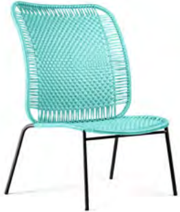
light green/black 00ACLC2-2