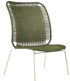
olive green/pastel green 00ACLC2-4