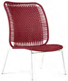
red/pink sand 00ACLC2-5