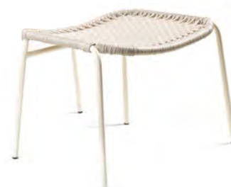
winter grey/pearl white 00ACFS-9