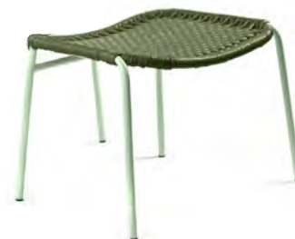
olive green/pastel green 00ACFS-4