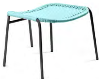
light green/black 00ACFS-2